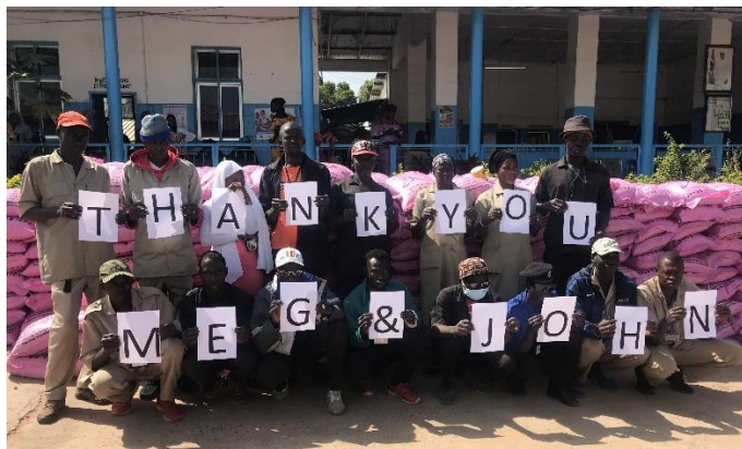
A precious gift to all staff to share with their families