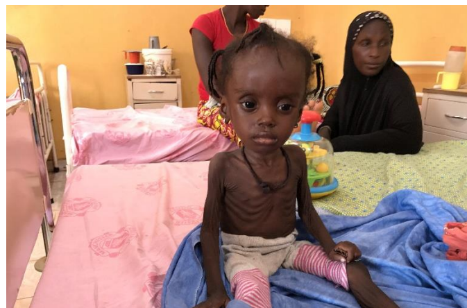
A severely malnourished Child in the Malnutrition Ward

For every product that they sell on line 30 pence is donated into the Form Feeding Fund. FFF has helped to save the lives of so many vulnerable patients, which of course includes many infants, in the region since its inception in 2017.