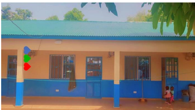
The accommodation block after renovations

The remaining homes have been named, as requested, by their sponsors;