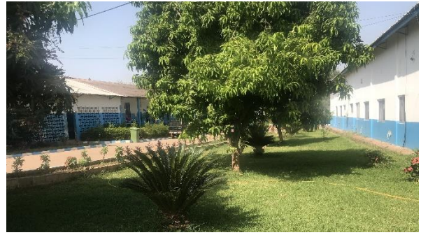
The grounds are now a vision of tranquillity

from the unrelenting heat from the sun. The hospital's extended vegetable garden was Baba's last gift that will keep on giving.