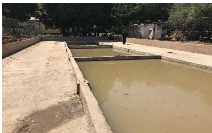
Three separated Tilapia ponds

YOU DID IT , £19,500 raised for quite possibly the first Fish Farm in the world to be built within the grounds of a hospital. This sustainable project will provide essential protein, one of the main building blocks in aiding a patient's recovery. A critical shortage of fish due to overfishing by large trawlers off the West Coast of Africa has led to increased fish prices. The 400-mile round trip to deliver supplies to the hospital greatly increased the burden of providing nutritious food for all the patients.