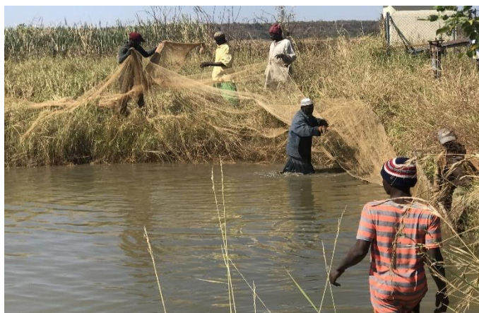
Harvesting the Tilapia Fingerling from one of six ponds

In January 2023, the three ponds had been filled ready for the introduction of 500 Tilapia Fingerlings.