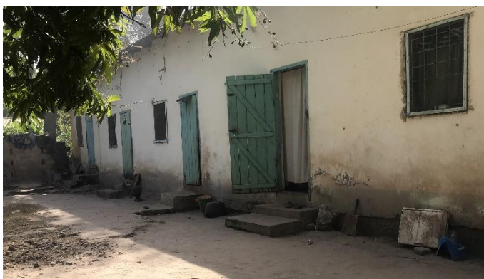
The accommodation block before renovations

We feel honoured to be naming one of the seven newly extended and fully renovated staff accommodation units "Tony's House" in memory of Simon Scarrows father.