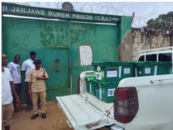
Great anticipation as the Trade Aid Boxes arrive