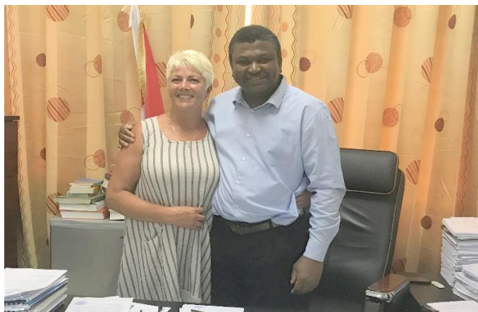
Anita with the Minister Of Health Dr A Samateh

The Minister of Health Dr A Samateh applauds this unique Fish Farm initiative.