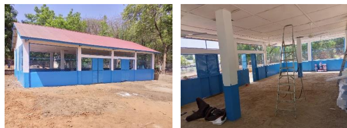
Soon to provide essential protein for patients diet

A couple who have supported BHA for the past 18 years funded another first for Bansang Hospital, a Broiler Chicken House that has been built within the grounds alongside the Fish Farm.