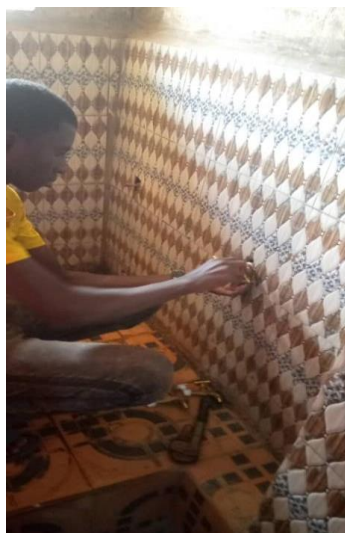
Inmates updating their facilities

A friend and supporter of BHA provided all the funds needed for the new toilets, sinks, shower facilities, all pipework and tiles in the three detention blocks.