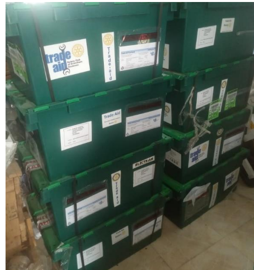
The magnificent gift of Trade Aid Boxes

The hospital's Maintenance Department was delighted to receive essential Trade Aid Boxes supplied and air freighted to The Gambia by this Rotary Club.