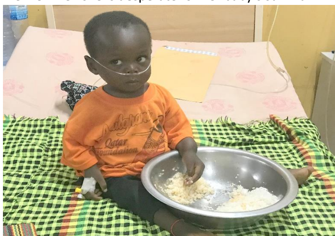
An infant and mother receives FFF support

I can only imagine the relief for a mother to be thrown a lifeline when she is desperate for her baby's survival.