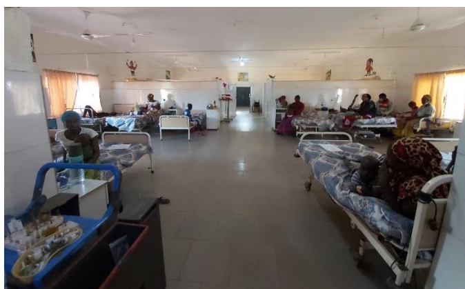
Surgical Ward, far end burns unit and dressings bay.

The £60,000 refurbishment was finally completed in August 2021. The refurb was not straightforward, it presented so many problems for patients, staff, and contractors due to the many restrictions imposed because of Covid-19.