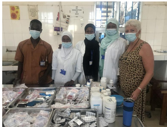
The Pharmacy Dispensary Department