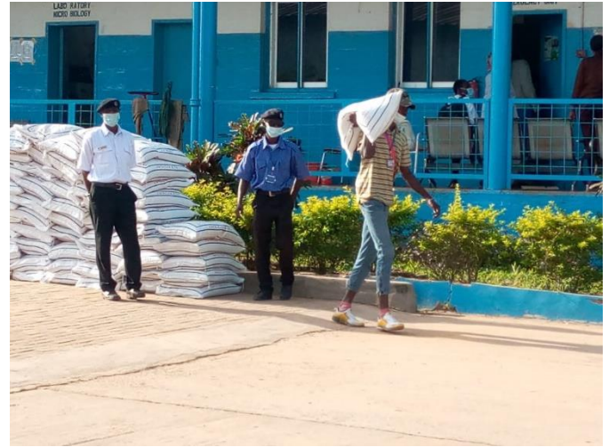
Every member of staff received a sack of rice last year

Africa has not contributed to climate change and yet they suffer the worst food and water shortages.