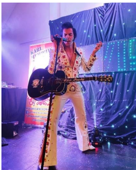
Elvis on stage in Orlingbury