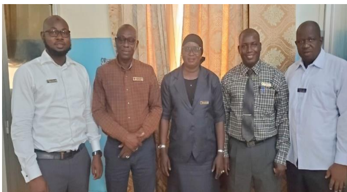
The Magnificent Management Team

Be assured that all your donations reach the Hospital to fund the intended projects. Please continue to donate to BHA for you are really saving lives in The Gambia"