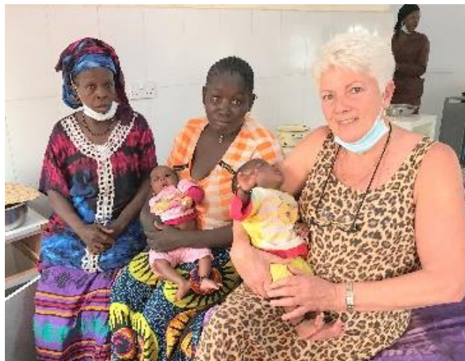
FFF supports twin baby girls and their Mummy