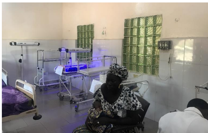
Neo Natal room

The £60,000 refurbishment was finally completed in August 2021. The refurb was not straightforward, it presented so many problems for patients, staff, and contractors due to the many restrictions imposed because of Covid-19.