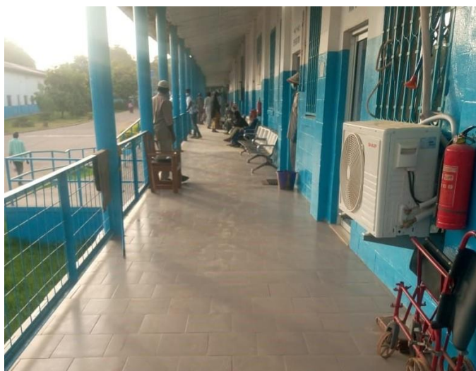
Veranda Walkway Tiling Completed

Can you imagine being rushed to the theatre on a trolley, negotiating different levels of concrete floor ways that were unavoidable and difficult to manoeuvre along. Not a pleasant experience and one that patients should not endure!