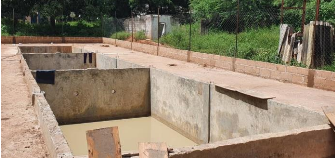
Three ponds under construction

Due to over fishing by foreign trawlers off the coast of West Africa the seas are almost devoid of fish. This is devastating for local fishermen and the knock on effect is grave shortages of fish throughout the Gambia. This is depriving the patients of the Bansang Hospital of fish protein which is one of the main building blocks in aiding a patient's recovery.