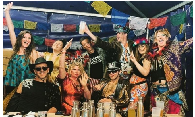
Magnificent Shambala Merchandise Team