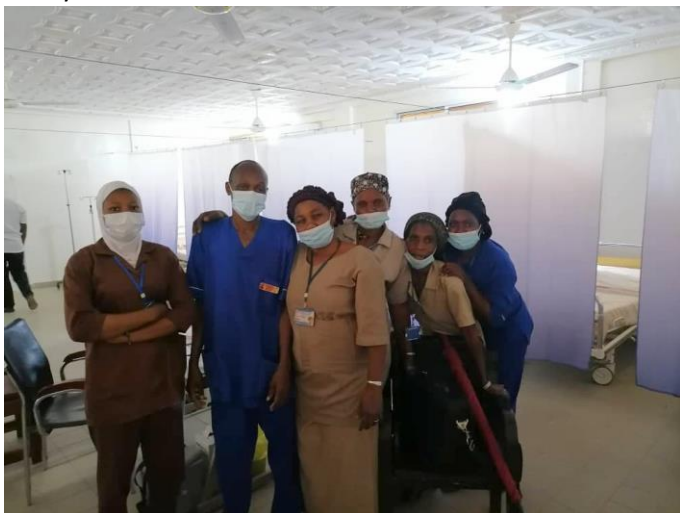
Some of our happy staff members

Now... A tranquil, safe, temperature controlled environment for mothers to bond with their precious newly born babies.