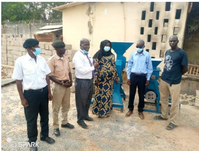
The Cous milling machine, welcoming party