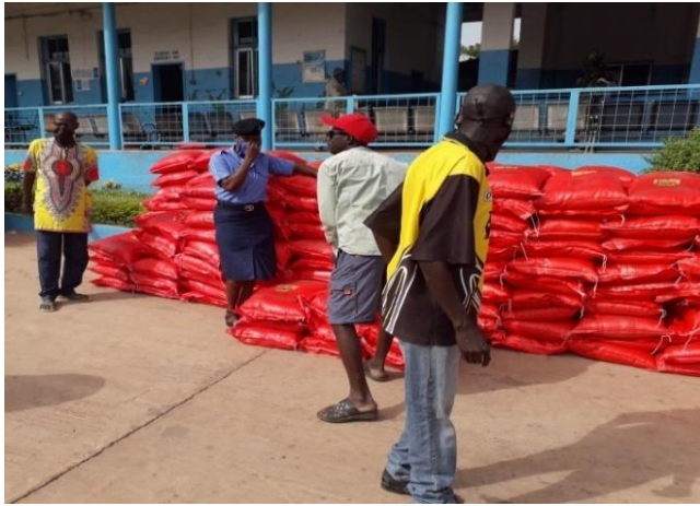
Rice delivery in May for all the staff

The Covid-19 pandemic impacted on the food supply and demand that disrupted critical supply chains. Working with the Management Team and recognising the needs of the hardworking staff who are on the front-line fighting Covid-19. A decision was made to prioritise food assistance ensuring that all staff received a 25kilo sack of rice.