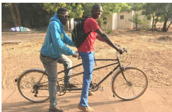
Very happy maintenance men, zero travel expenses!

A tandem bike was donated and shipped in our last container by former intrepid traveller Steve Dart. The tandem caused great excitement, a bicycle made for two... never been seen before in rural Gambia. It's the perfect bike for the hospital's two young maintenance men, to travel back and forth to work each day as they both live in the same village. Such a gift is a real morale booster.