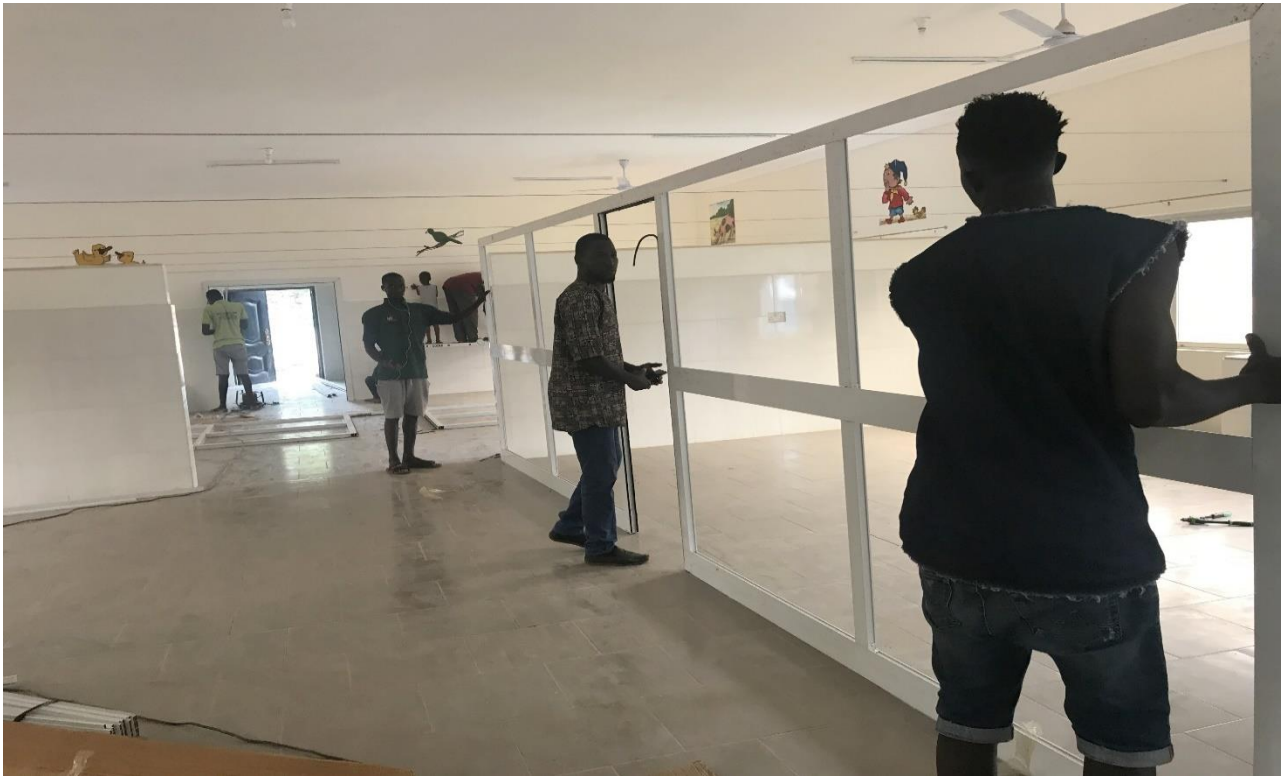
Installing ward partitions in the renovated children's unit

We did it! With your magnificent support, this enormous 80 bed Children's Unit has finally opened its doors to a bright and new infection-controlled environment, there's plenty for the children and staff to smile about.