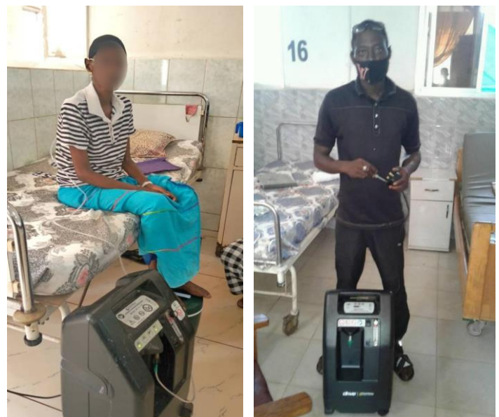
Patient receiving oxygen