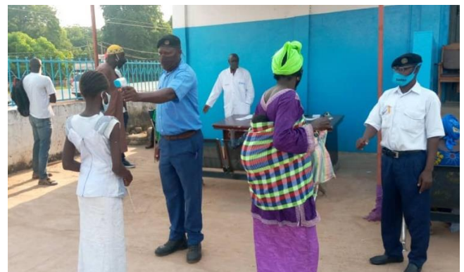
Temperature screening before entry

With immediate effect upon my return home, funds were transferred so that the Procurement Officer could secure urgent supplies to help with infection control measures. The 400-mile round trip was made to purchase bulk supplies of hand sanitiser, soap, bleach, and large water containers with taps.