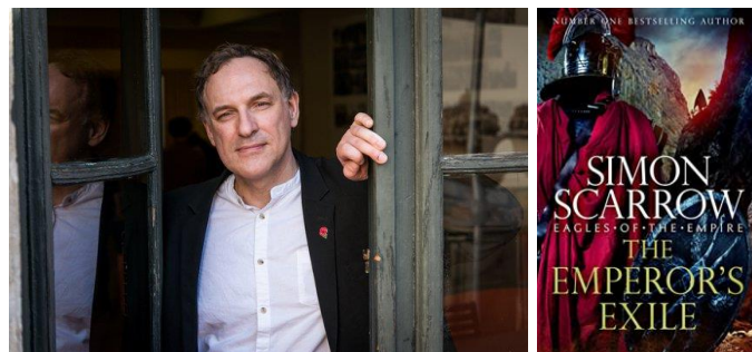
A Thrilling New Roman Epic from Simon Scarrow

The last fifteen of Simon's novels have been Sunday Times bestsellers, with his works having been translated into over twenty languages.