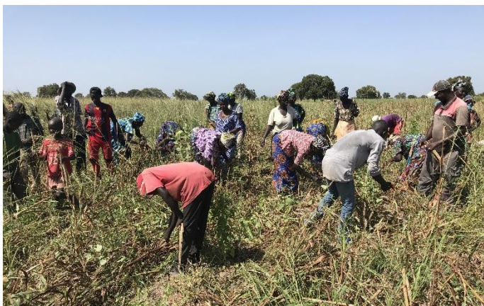
Villagers harvesting the couscous for the hospital

This year the hard work of the local village communities and high levels of rainfall has resulted in a bumper harvest of couscous, this is despite not being able to farm their land across the border in Senegal due to Covid-19. The crop will be threshed, put into sacks and stored for supplementing patient feeding throughout the coming year. Additional sacks are sold to staff at a much subsidised rate.