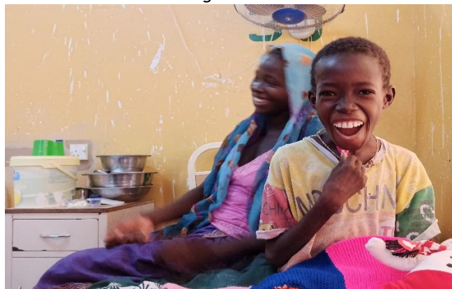
Happy mum and son