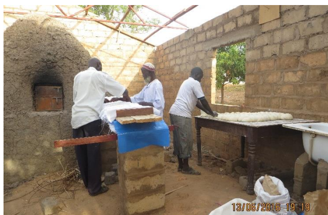
New hospital bakery: funded entirely by profits from the 2015 crop

This final stage of funding will enable us to buy a second Massey Ferguson along with the associated ploughing machinery (for a total of £12,000 including shipping). The provision of this additional tractor will give the hospital a year-round source of additional income, helping dramatically boost not only our own crop yield, but also those of the communities who will pay to use it. The profits from crop sales will make the project entirely self-sufficient, and allow the hospital to fund new patient care initiatives (along with a canteen for the hospital). On a personal level, this project will also help take a great fundraising burden off my shoulders