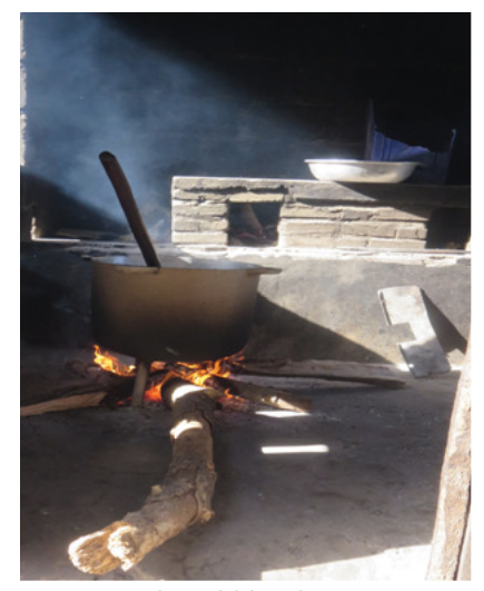
The old kitchen

We are also very pleased to announce that a specialist contractor has built a sustainable kitchen for the hospital (the funds for which were kindly donated by colleagues and friends of the Myers). Previously, our cooks prepared and cooked food for the patients on an open fire, enduring incredible heat and smoke with no protection from the elements. The new cooking facility is designed to enable 4 pans of food to cook at the same time; the smoke is taken away by the chimney flue, using a fraction of the wood used in the old kitchen.