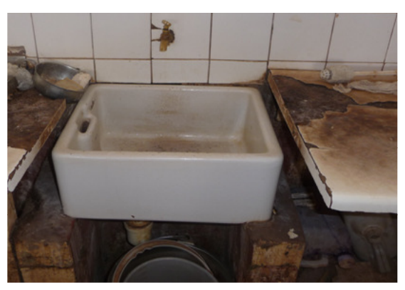
Old dispensing room