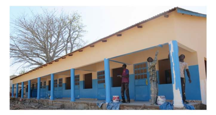
New staff accommodation