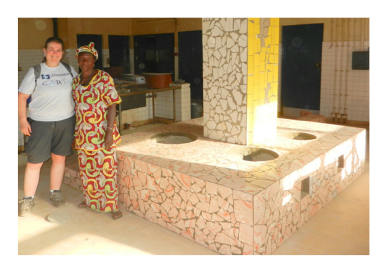
New sustainable kitchen