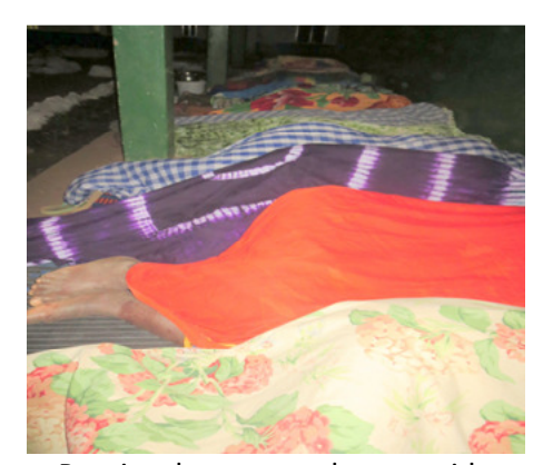
Previously, escorts slept outside