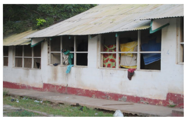
Old staff accommodation

Staff retention is still the key to a fully functioning happy hospital, therefore decent accommodation is vital. The average cost for each unit that we are renovating and extending is £4,000. We have recently completed a block of 8 units, which consist of a bedroom with ensuite toilet/shower and sitting room. For each family home, all of the materials are sourced and made locally, which in turn helps the local economy. Each block of 8 units shares a communal kitchen. Work is well underway extending and refurbishing a second block of 8 family homes for staff.