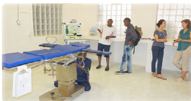
Refurbished old Theatre