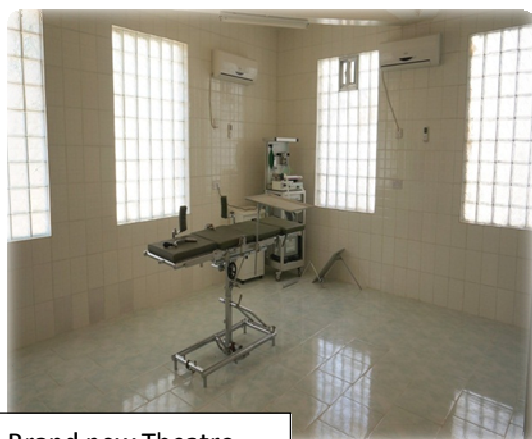
Brand new Theatre

friends of BHA who have joined hands in helping to make this possible.