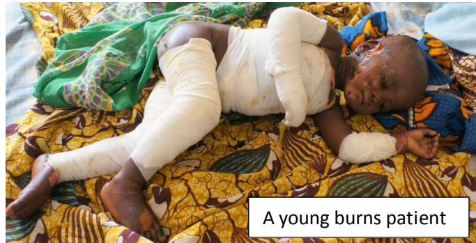
A young burns patient