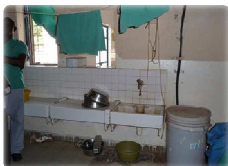
The old Sterilization Room