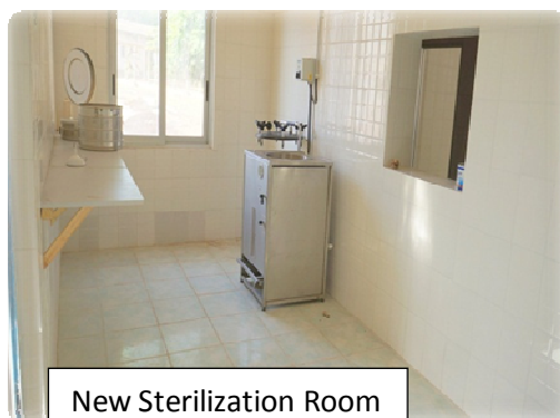
New Sterilization Room