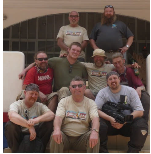
An amazing scooter delivery team

HONDA C90 SCOOTERS— March saw the arrival of the third team of mad scooter enthusiasts! Nine men, eight scooters, one 4x4 backup vehicle and trailer again braved the rigours of the Atlas Mountains and the Sahara. It is an incredible achievement to travel from the UK at 40 miles per hour to Bansang Hospital, through some of the most inhospitable terrains in the world. The weather was dreadful, including rain in the Sahara! Bansang was 49°C in the shade!