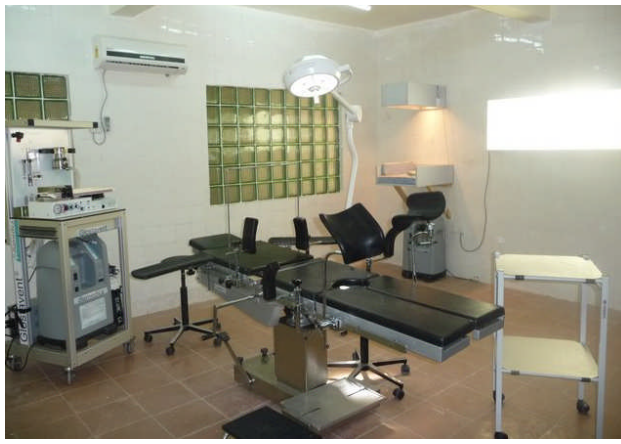
New Obstetric Theatre Unit

OBSTETRIC THEATRE UNIT – I am thrilled to announce the completion of the new obstetric theatre at Bansang Hospital, built entirely by our own maintenance team.