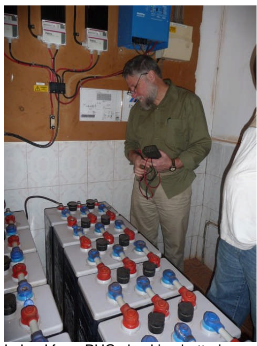
Leland from PUG checking batteries

in conjunction with Global Energy who are designing a bespoke Energy Plan.