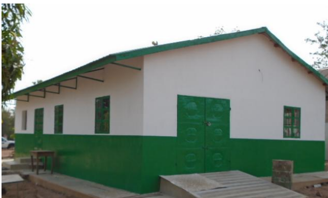
The brand new (fully operational) maintenance department!

These latest works are a continuation of those first overseen by trustees of BPEC back in January 2013. On that occasion, the BPEC team oversaw the completion of various aspects of the plumbing works that their award had so generously helped fund. Staff, patients & trustees were delighted with the construction of new bathroom facilities, toilets, showers and sewers throughout the hospital.