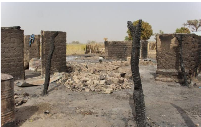
The devastating aftermath of the bush fire