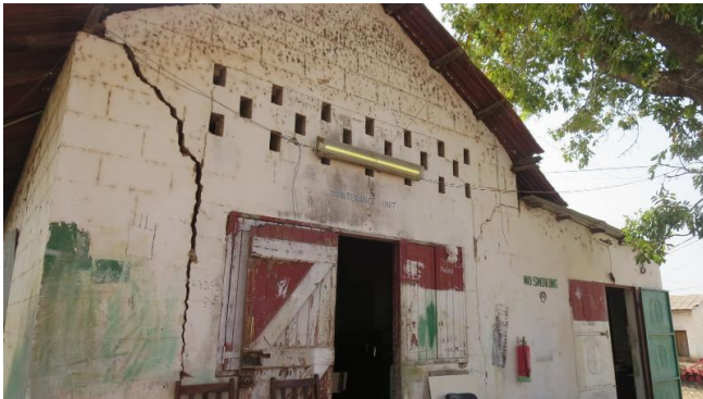
The old maintenance department (now demolished)

Much to the excitement of the maintenance team, the funds also extended to building a new maintenance department and adjoining offices. These works (began last January) are now completed with the team fully operational in their new headquarters!