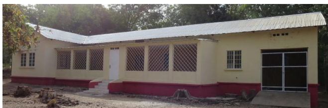
AFTER: Transformed into a wonderful family home